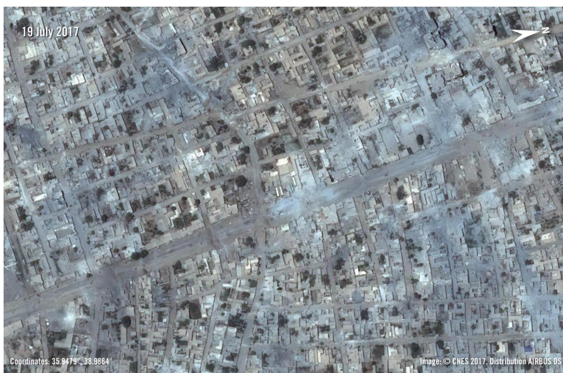
Raqqa, Ihsewa crossroad area. Imagery taken on 19 July 2017 after a series of strikes launched on 9 June. Coordinates: 35.9479°, 38.9864°.

It all happened in the space of a few minutes, sometime between 1 and 2pm, the shells struck one after the other. It was indescribable, it was like the end of the world – the noise, people screaming. If I live a 100 years I won't forget this carnage. Artillery shells are hitting everywhere, entire streets. It is indiscriminate shelling and kills a lot of civilians". 21