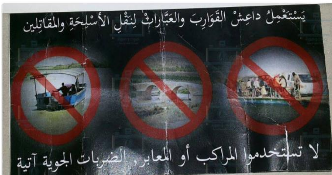
Leaflets dropped by the Coalition over Raqqa in March 2017.

On 2 July 2017 Lieutenant General Stephen J. Townsend, the US commander of the Coalition force leading the operation, was quoted by the New York Times saying: