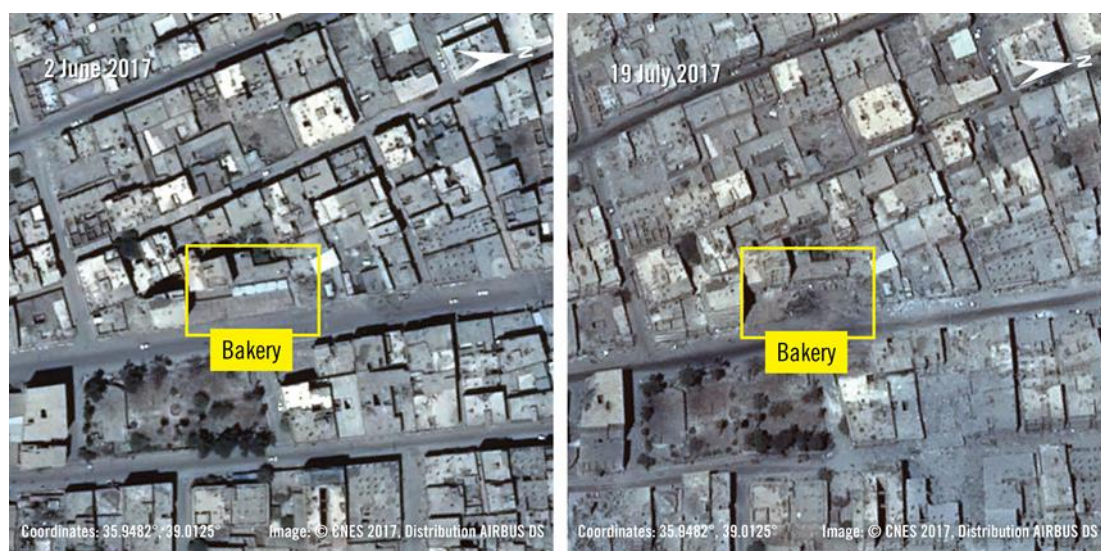
Imagery taken on 2 June 2017 and on 19 July, before and after an airstrikes launched on the evening of 8 June 2017. Coordinates: 35.9482°, 39.9864°.